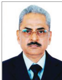
About the Author